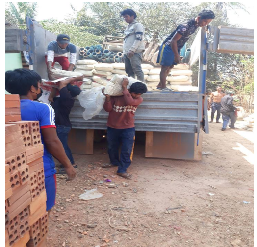
WFC staff assisting families unload construction materials for their own household latrines

Our field staff also supports selected village latrine projects by supplying expert guidance and the underground component materials that allow participating families to construct their own private latrine. Water for Cambodia supplies the know-how and each family supplies the labor to dig the pit and construct the enclosure. These pilot efforts provide families with the means to get their own latrine and demonstrate to the commune and village leadership the methods and benefits of latrines as well as providing examples to incentivize other families to aspire toward having one. In the past several years the country wide interest in latrine construction has taken on added importance signaling an important step in better health and economic growth.