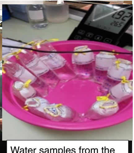
Water samples from the field ready for analysis

working groups providing wells to remote villages. It has also conducted water