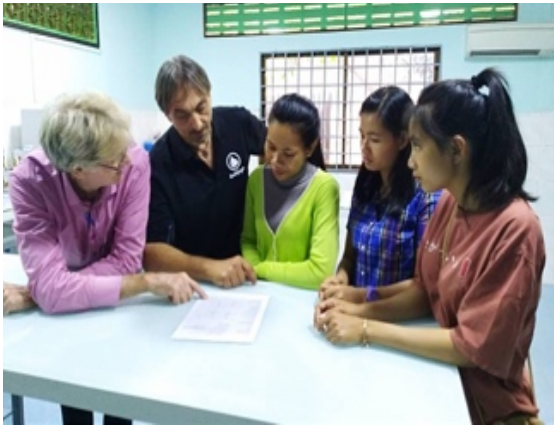
Southy and Massimo help train the Lake Clinic staff in proper water sampling

water other are are built water dis infra as With or f