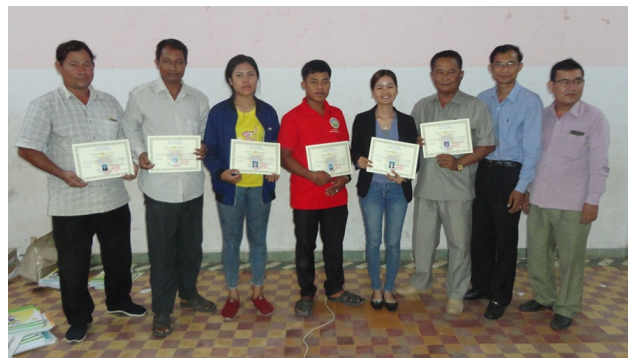
Teachers receiving their certificates after completing the supplementary WFC

This program is coordinated with the Siem Reap Ministry of Education to guarantee compliance with local rural education