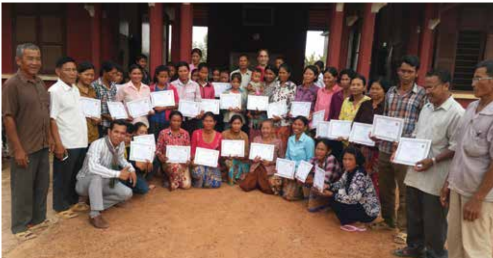
Graduation ceremony for our latest literacy classes.

Water for Cambodia has developed strategic partnerships with local organizations to help strengthen village capacity building and WASH (WATER, Sanitation and Hygiene) training. These partnerships allow WFC to leverage our capabilities by addressing latrine, water sources and community needs.